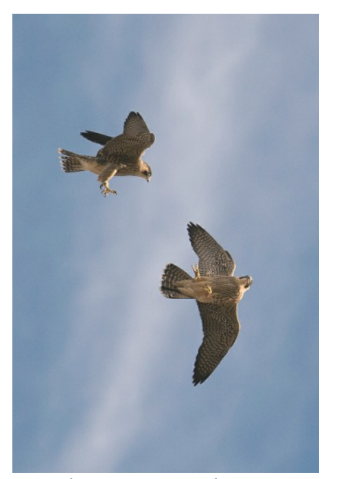
Juvenile Peregrines, Woking, 15 Jun 2017

Guatemala and Libya. Some of the interesting towns more cities include: Jeddah (Saudi Arabia), Rauma (Finland), Albuquerque (New Mexico), Leeuwarden (Netherlands), Lodz (Poland), Bury St. Edmunds (UK), Santa Monica (California), (Bavaria), Wackersdorf Nafplio (Greece), St. Julian's (Malta), Mecca (Saudi Arabia).