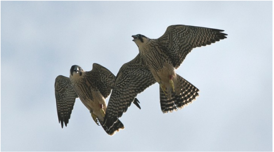
Juvenile peregrines, Export House, Woking, 19 Jun 2016 (James Sellen)