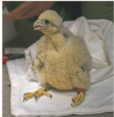
Peregrine chick after ringing and before being returned to the nestbox (James Sellen)

03/06/2016 - Both juveniles seen approx. 20ft to the right of the nest box (viewed from the WWF Living