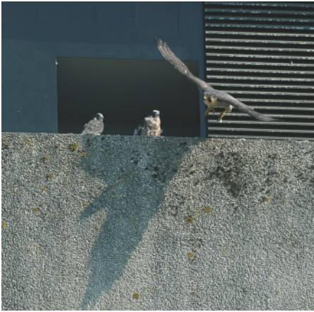
Adult falcon & juveniles outside of nestbox, 5 Jun 2016 (James Sellen)

Planet Centre and Peacock's car park) whilst adult tiercel was perched at the s/west end of Export House.