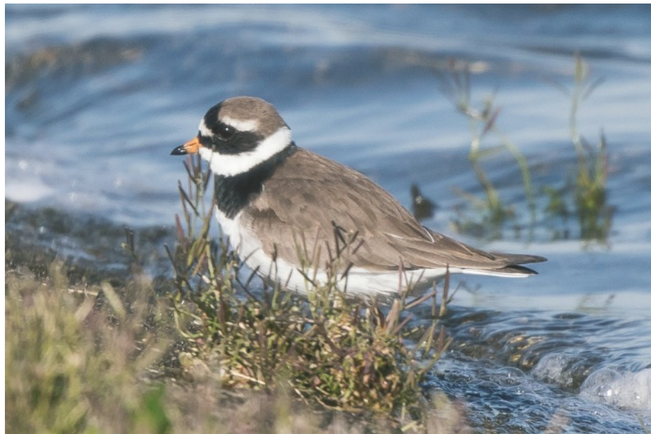
Fig 4. Ringed Plover, Staines Res., 30 Apr 2016 (David Carlsson)