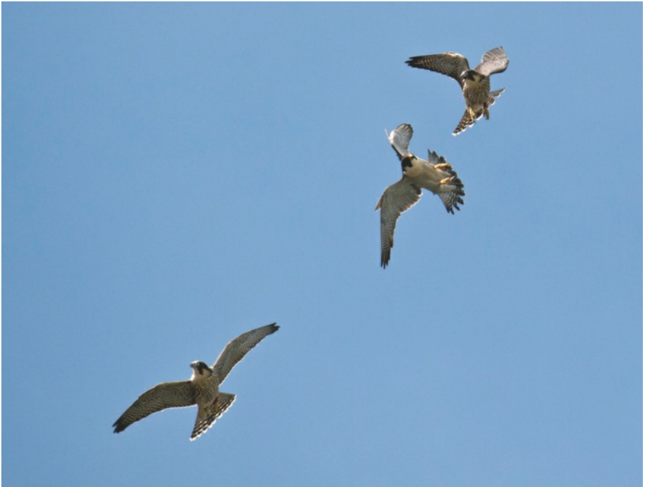
Adult tiercel with juvenile peregrines, Export House, Woking, 19 Jun 2016 (James Sellen)