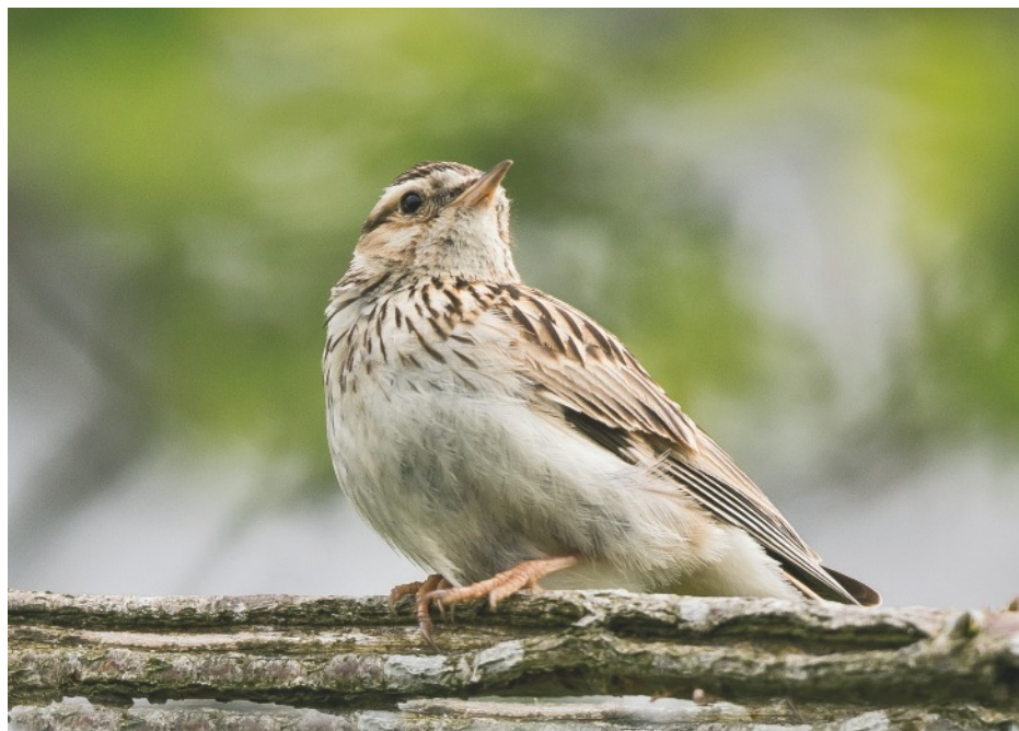
Fig 5. Woodlark, Thursley, 19 May 2016