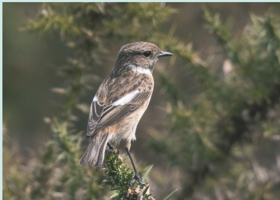
Fig 7. Female Stonechat, Thursley, 12 May 2016