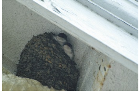
House Martin nest

In the meantime, if you are a Heronry census surveyor already and have not got your 2016 results in yet, please can you do so as soon as possible.