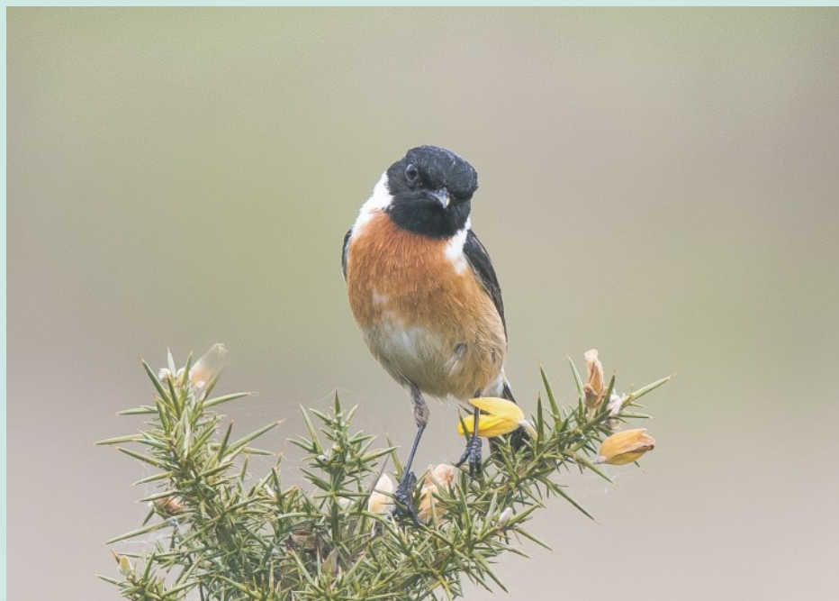
Fig 6. Male Stonechat, Thursley, 19 May 2016