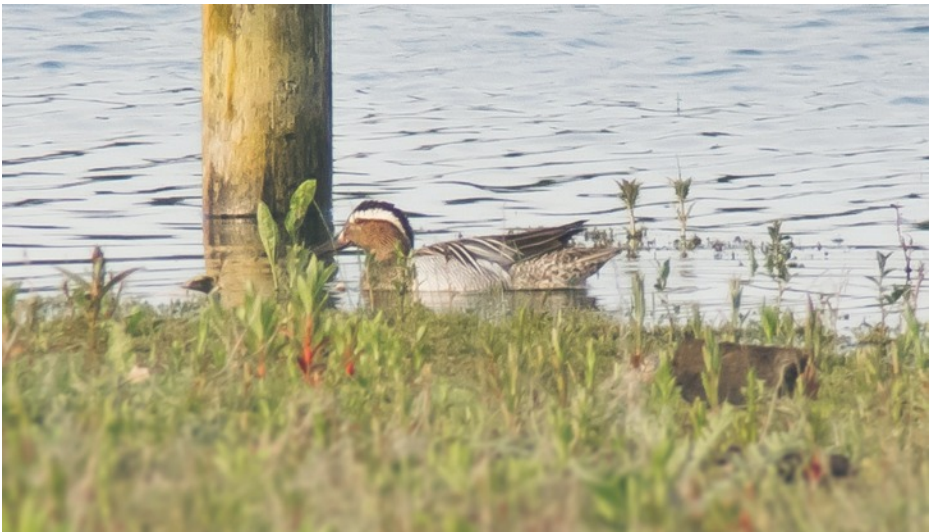
Fig 3 Garganey, Tice's Meadow, 17 May 2016