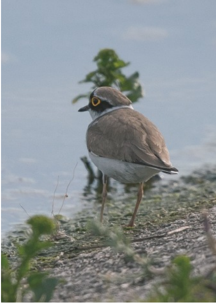
Fig 1. Little Ringed Plover, Staines Res. (David Carlsson)