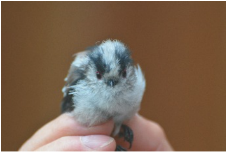
Long-tailed Tit ("Sweetie")